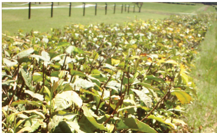
Tea -- The Charleston Tea Plantation is the only tea plantation in North America

Calendar Submissions: calendar@lsm.us.mensa.org