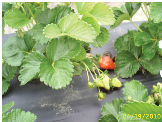
Univ. of GA Savannah Strawberry Farm