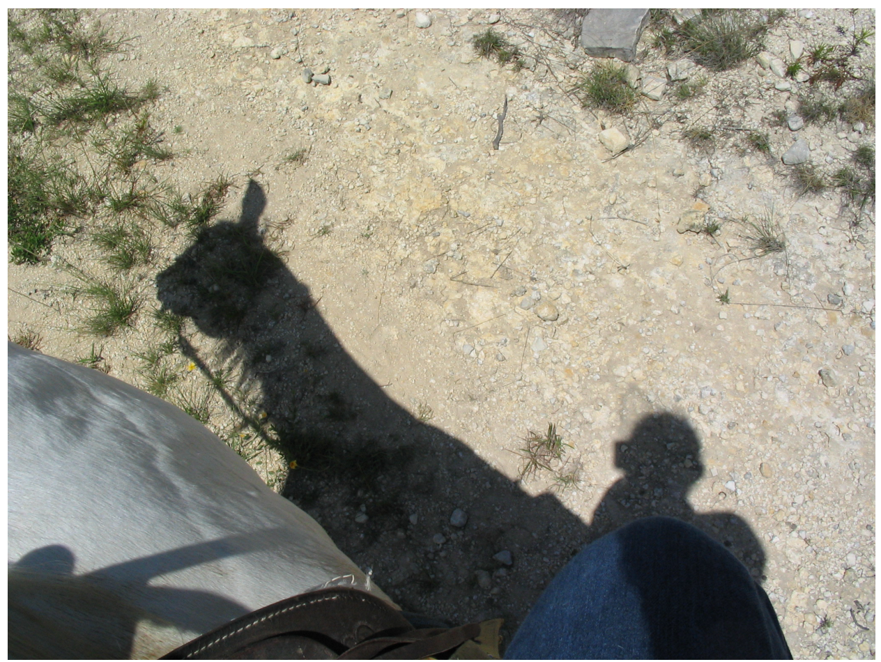
Shooting at Shadows