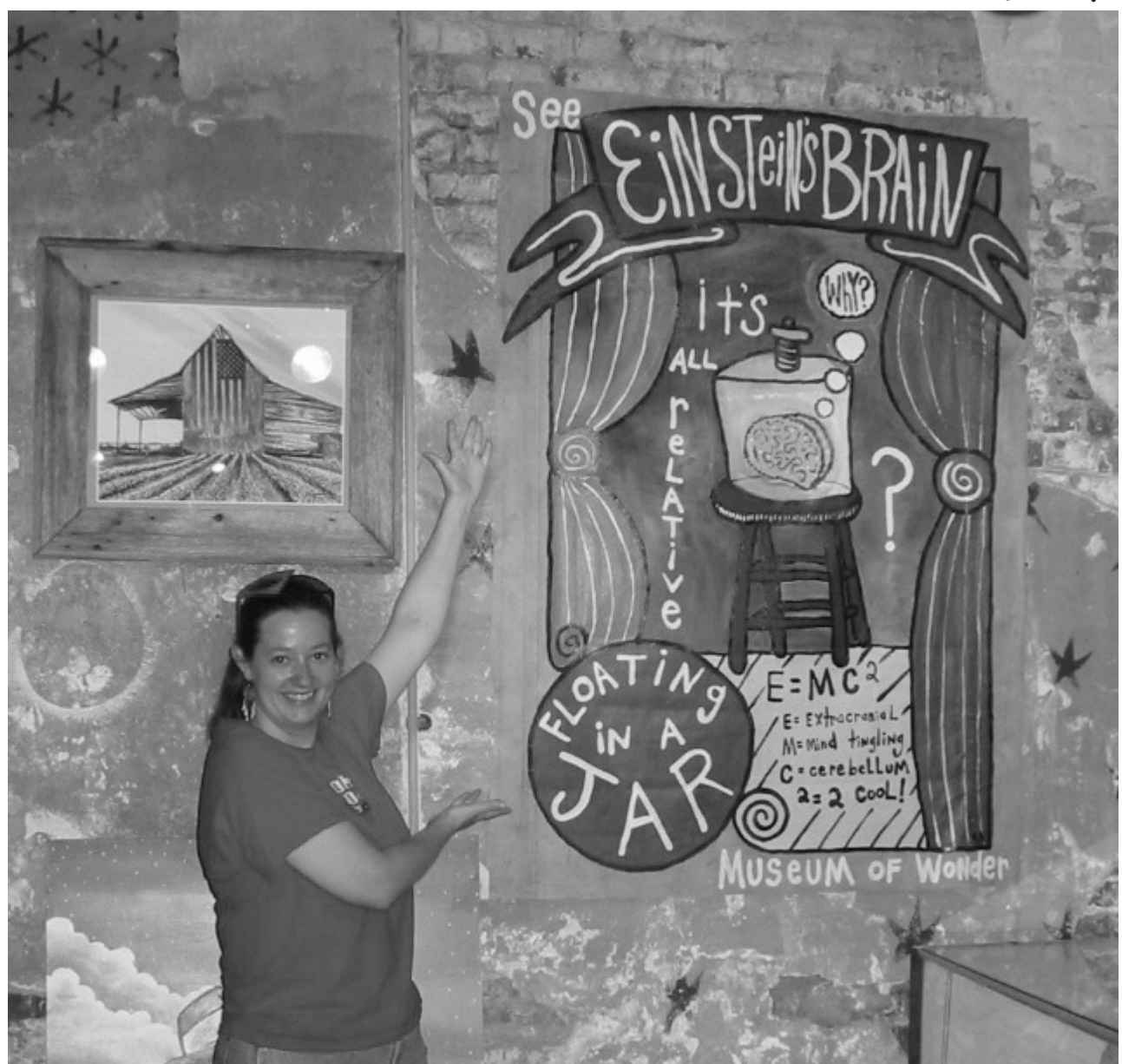
The Center for Southern Folklore, Memphis TN