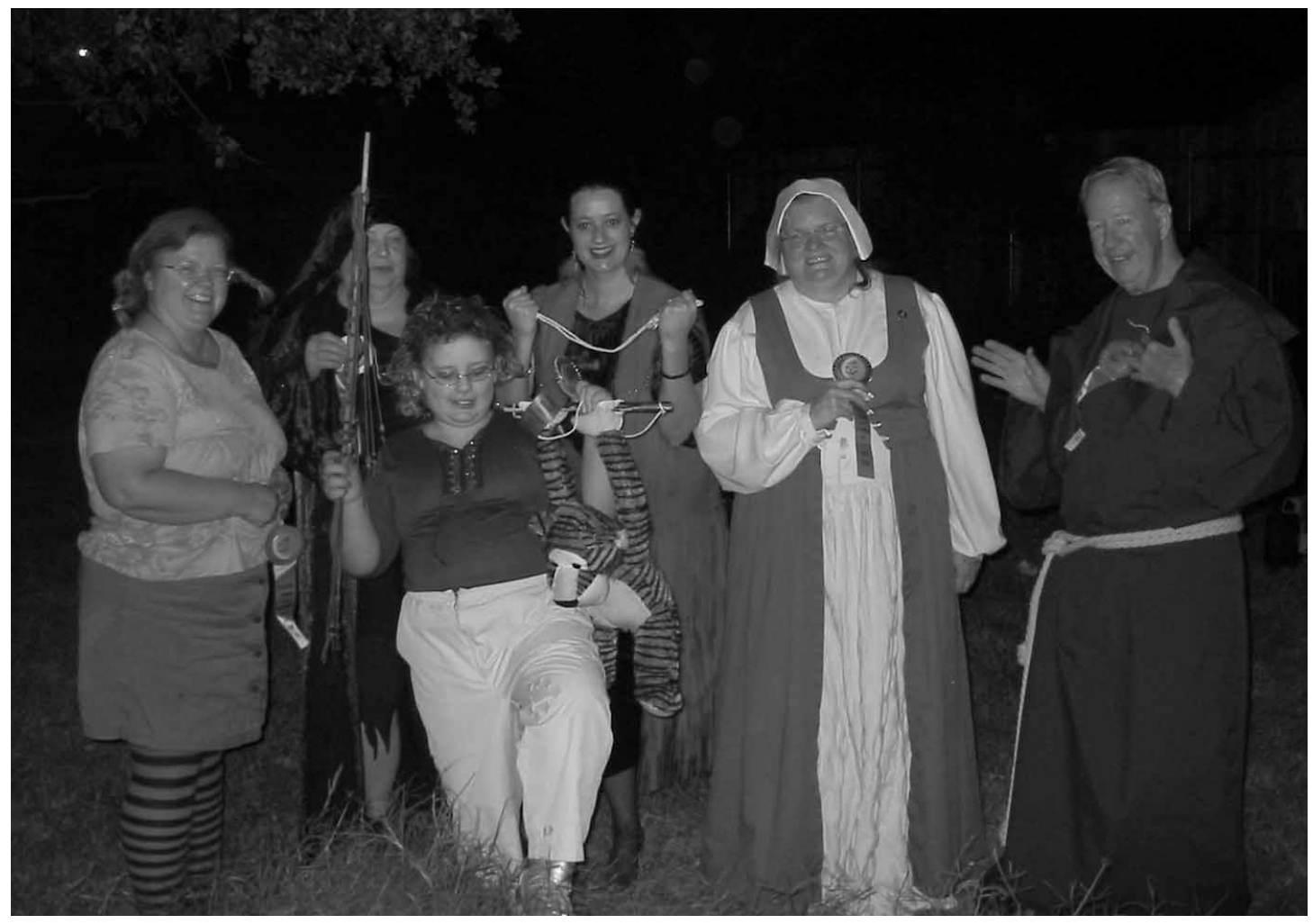
Halloween Costume Party Winners

Editor's Note: All photographs in this issue were taken by me, unless otherwise indicated. I do not remember the names of all (or even most) of the people featured.