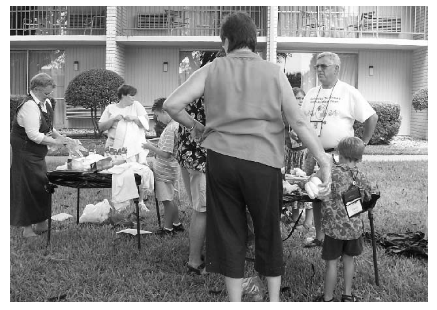
Tie Dye Workshop at Lonestar RG VIII