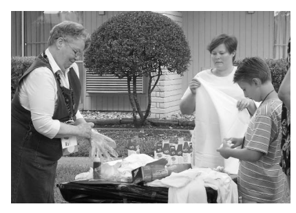
The Tie-Dye Workshop.