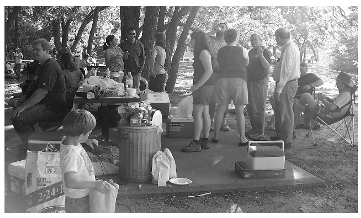
Spring Picnic at Northwest Park in May