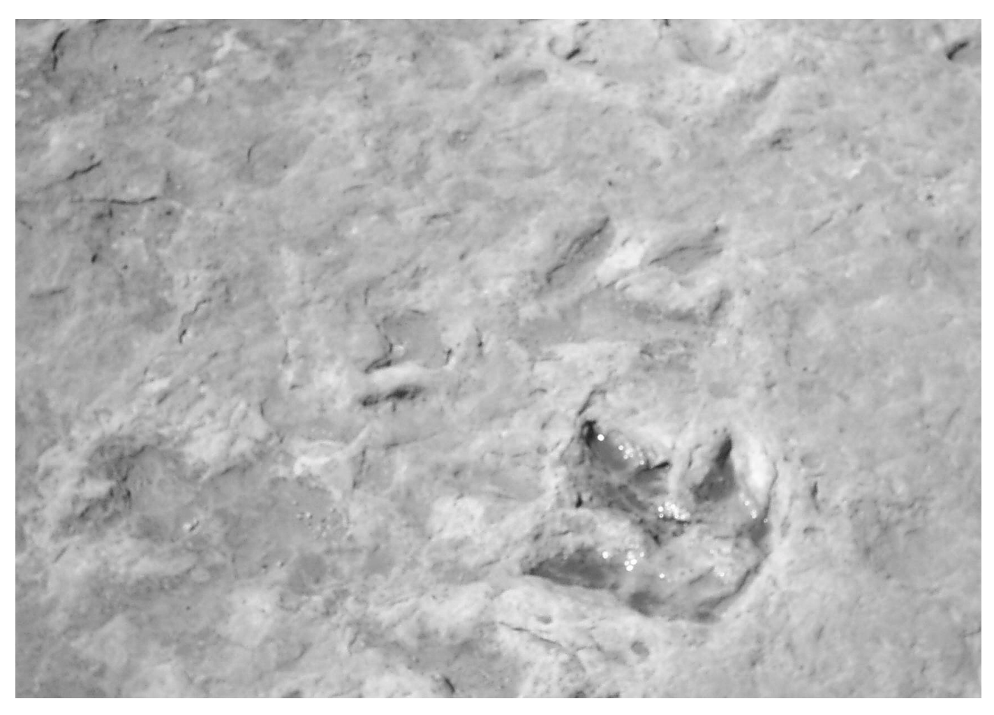
Dinosaur Tracks, Navajo Nation