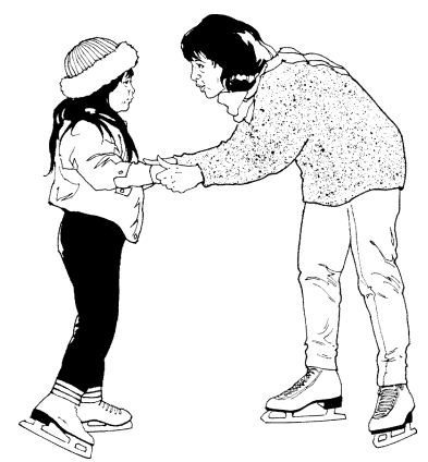
Ice Skating at Northcross Mall

Put it all together and it comes right back to Fun. LonestaRG VII will be a lot of fun. It'll be even more fun if YOU are there, because everyone who goes adds to the event. Where else can you listen to a dozen great speakers, play games, go to a dance, and eat and drink all weekend for only about $50? Join us this Labor Day Weekend! If I haven't convinced you, please take a look at our website (http://www.lsm.us.mensa.org/lonestarg.htm) where you can see all the fun people had last year, or give me a call (512-310-7863) or drop me an email (neemidge@usa.net) and I'll be happy to answer your questions.