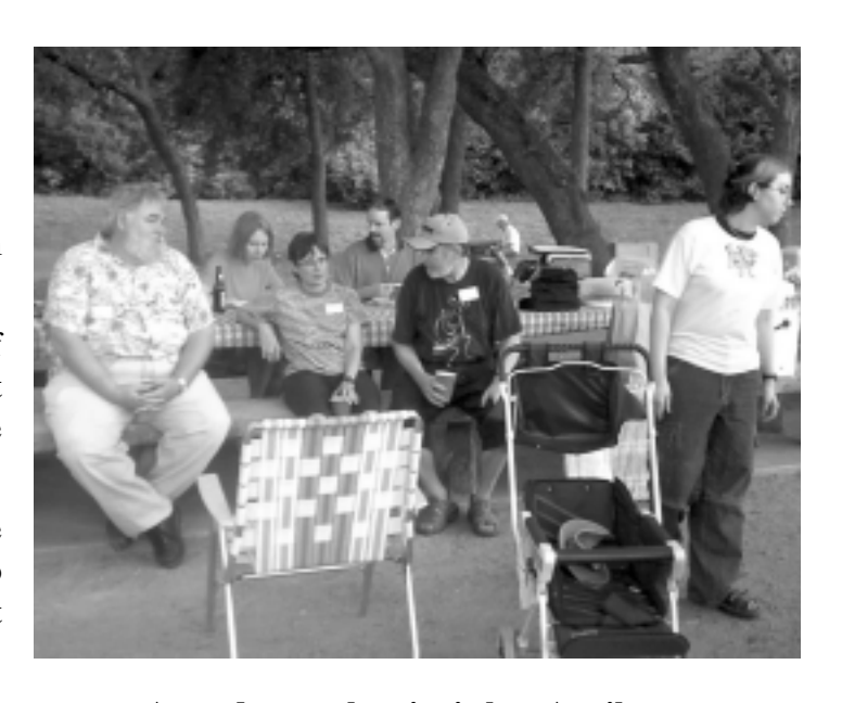
Attendees at the picnic last April.

They have promised to bring lots of rockets and equipment too. (We know how you Mensans love to play with equipment). We hope members with children will bring them along. This topic is especially suited for them.