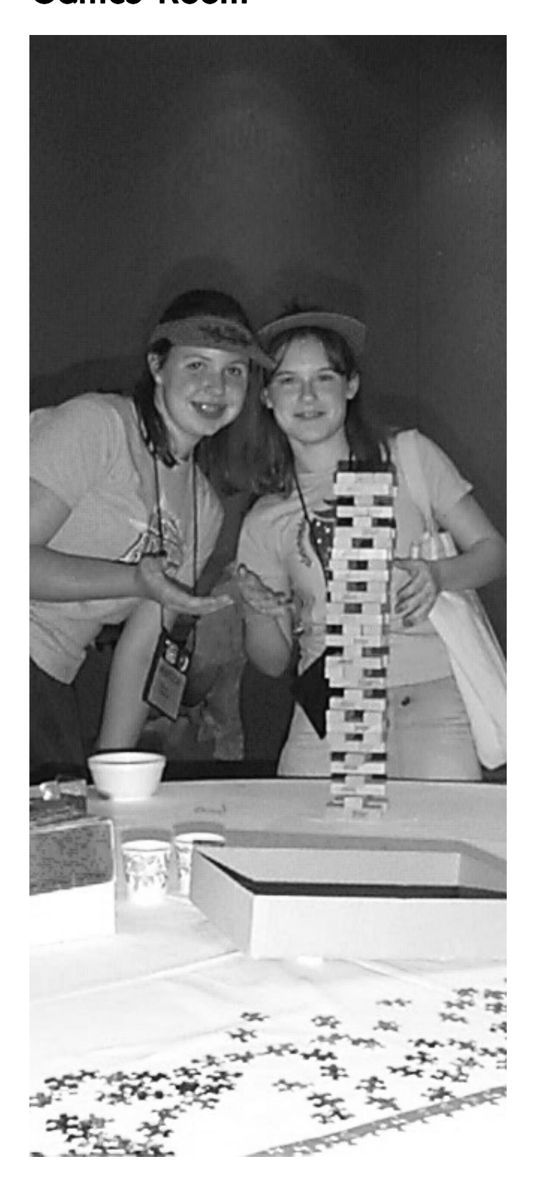
"A Tale of Two Tower Topplers"