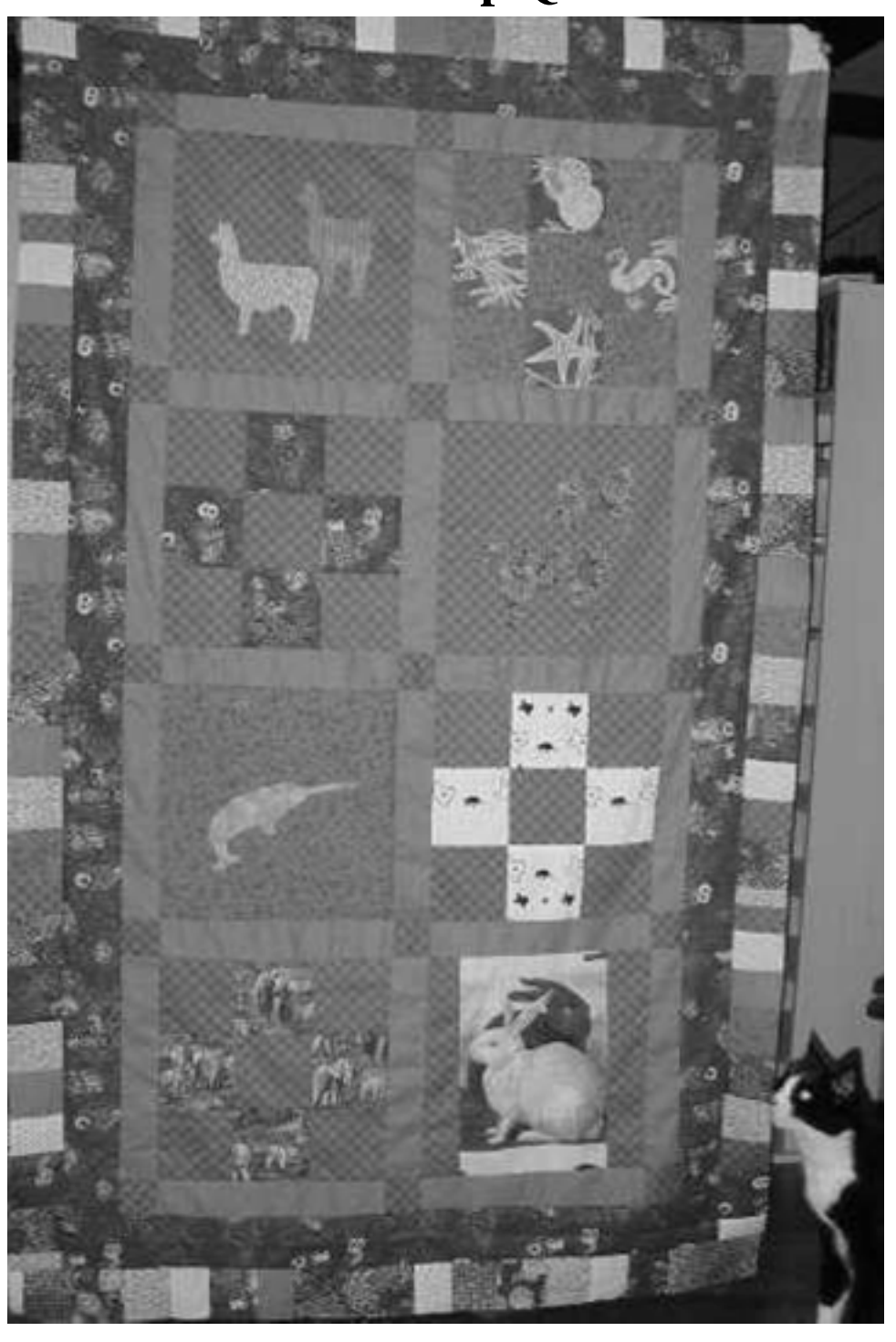
- Quilt and photo by Kelly Wagner